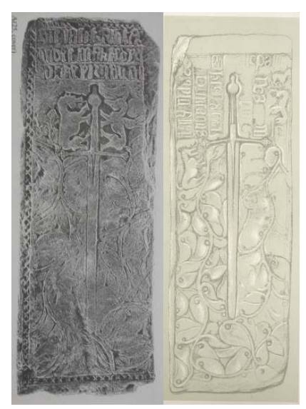
25 Cover 26 Cover