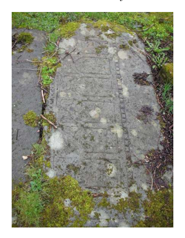
DESK BASED ASSESSMENT